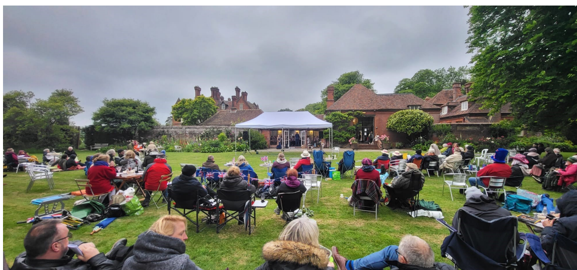
Summer 2022 Concert en pleine aire in Kent